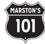
CALIFORNIA FRESH CUISINE + COCKTAILS