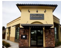
CALADERO EVENT ROOM perfect for events + meetings